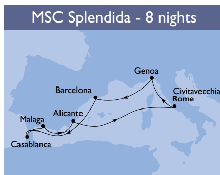
MSC Splendida - 8 nights