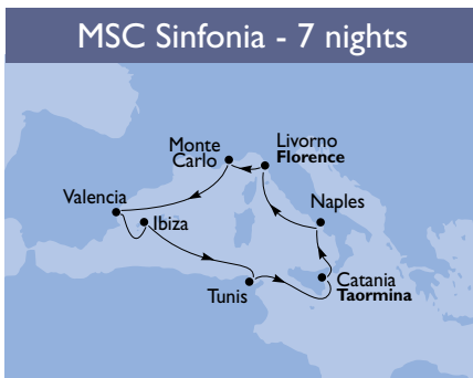
MSC Sinfonia - 7 nights

Monaco, Spain, Balearic Is, Tunisia, Italy